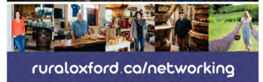
2022 Rural Oxford Economic Development Year in Review