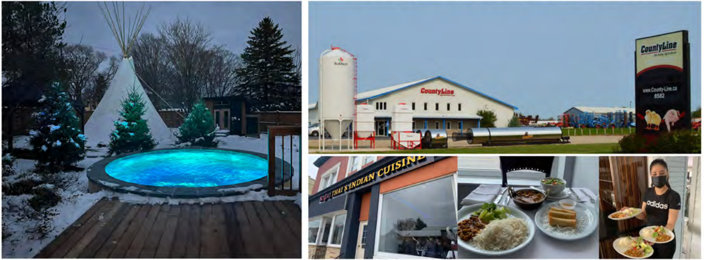
2022 Rural Oxford Economic Development Year in Review

Terra Nova Nordic Spa & County-Line in Hickson. Raja Thai & Indian Cuisine in Tavistock.