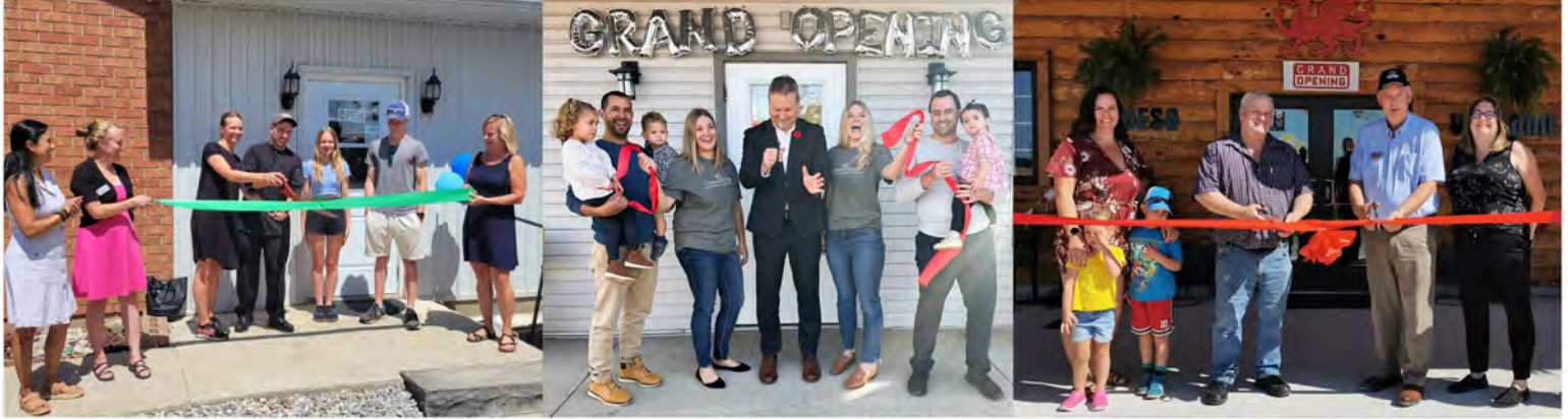
2022 Rural Oxford Economic Development Year in Review

Red Dragon Dairy in Salford. Jordan's Divine Dish Restaurant & Catering in Norwich.